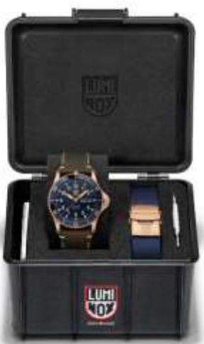
Sport Timer Automatic – 0923.SET SGD $2,665 before GST