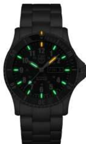
Sport Timer Automatic – 0937 SGD $2,495 before GST